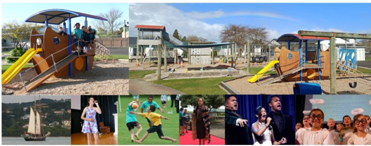
Experience our classes Explore our beautiful grounds Feel what defines us as a Christian School

Please encourage people to be in quick and to get in touch if they can't make this Open Day. This year our roll spaces were reserved and filled very quickly. It is also interesting to note that nearly every Christian school around the country has filled over the last 12 months with some having waiting lists breaking into the thousands!