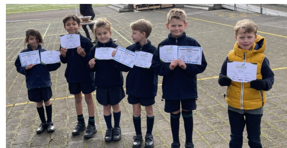
The Hawks— Year 2– 3. 9th in the Juniors