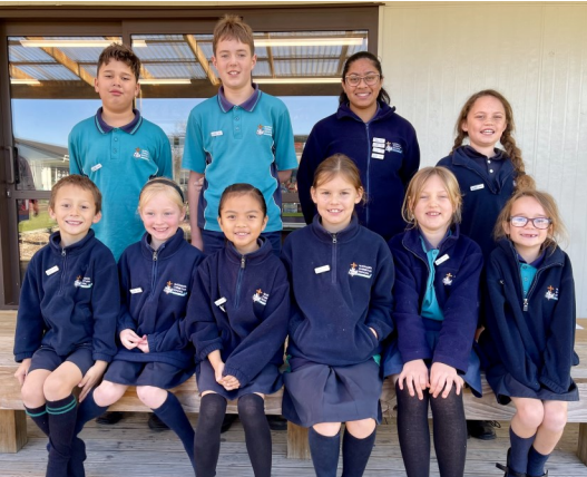
Above: Term 2's Rockstar and Memory Verse recipients from each class.